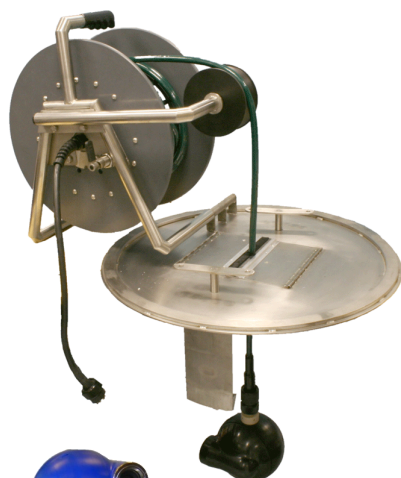
SCR-40 With custom base