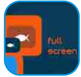
Insert Coin & Instructions screen