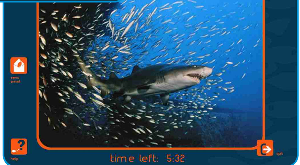
Main Control screen